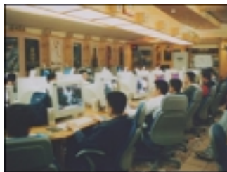
Many South Koreans are serious video game players

The forecast came in a wide-ranging survey produced by the South Korean government to find out what consumers will want from future technologies.